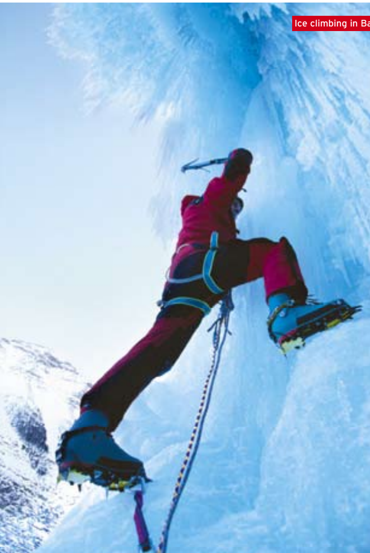
Ice climbing in Banff

makes powder skiing easy for beginners. CMH's Valemount Lodge hosts only ten skiers per week and has a private helicopter available for unlimited skiing. The CMH Nomads tour flies four skiers to six heli-skiing areas that span the Monashee and Selkirk ranges.