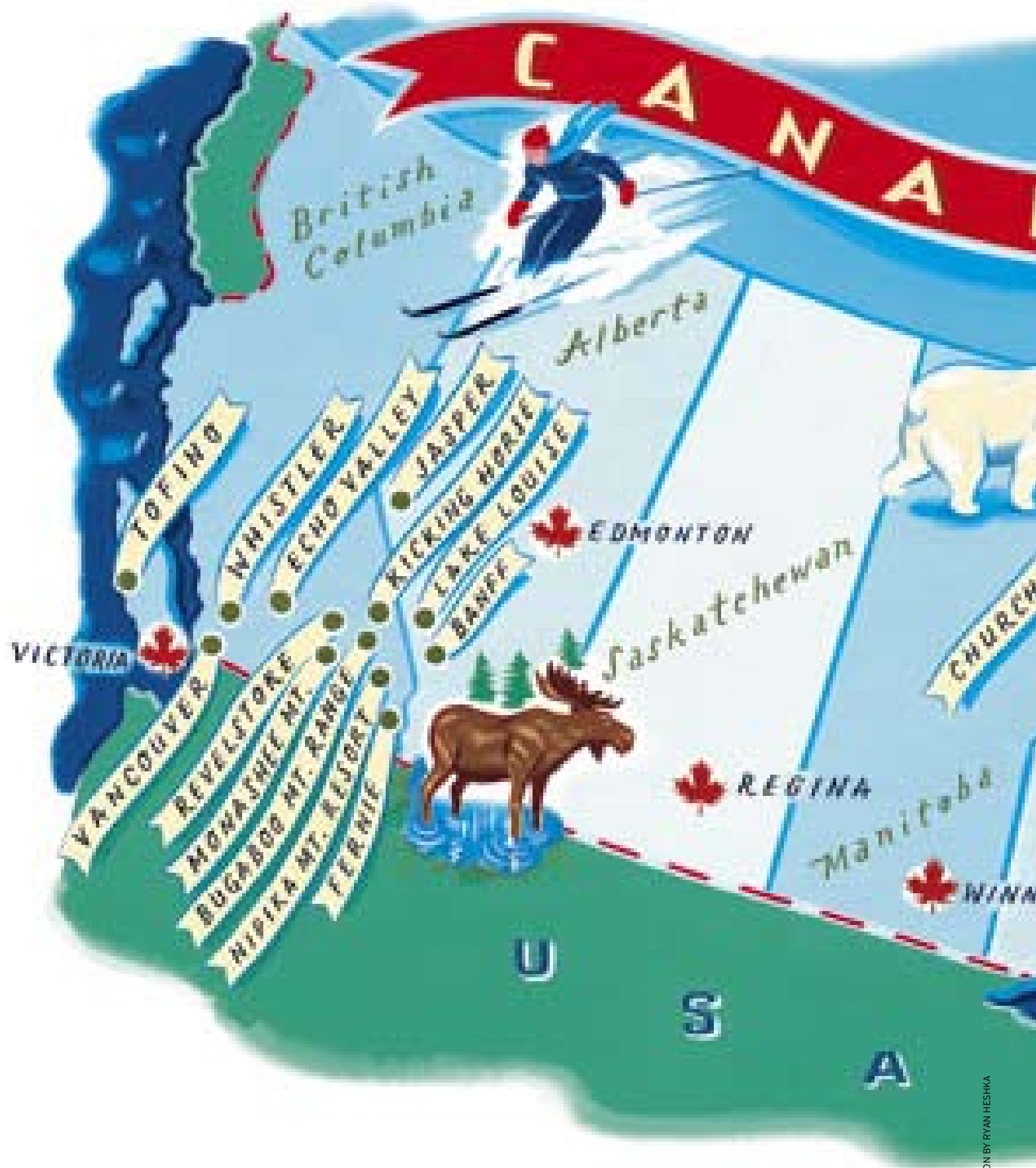
ILLUSTRATION BY RYAN HESHKA