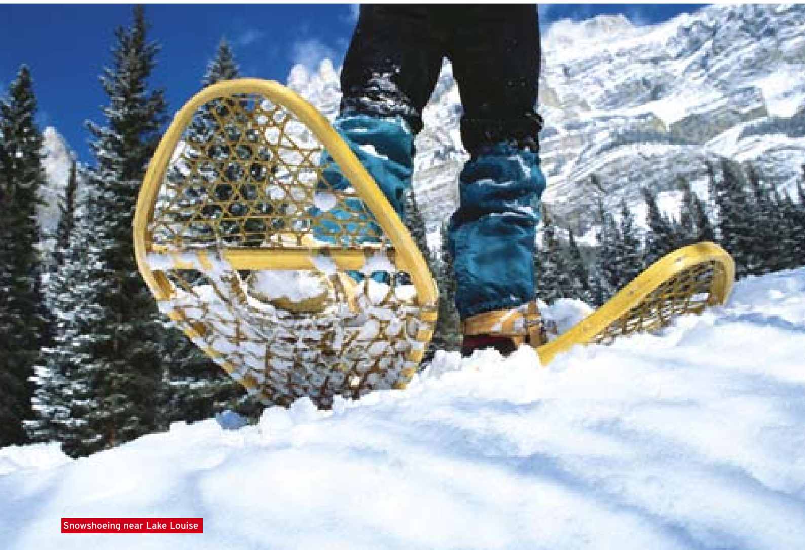
Snowshoeing near Lake Louise