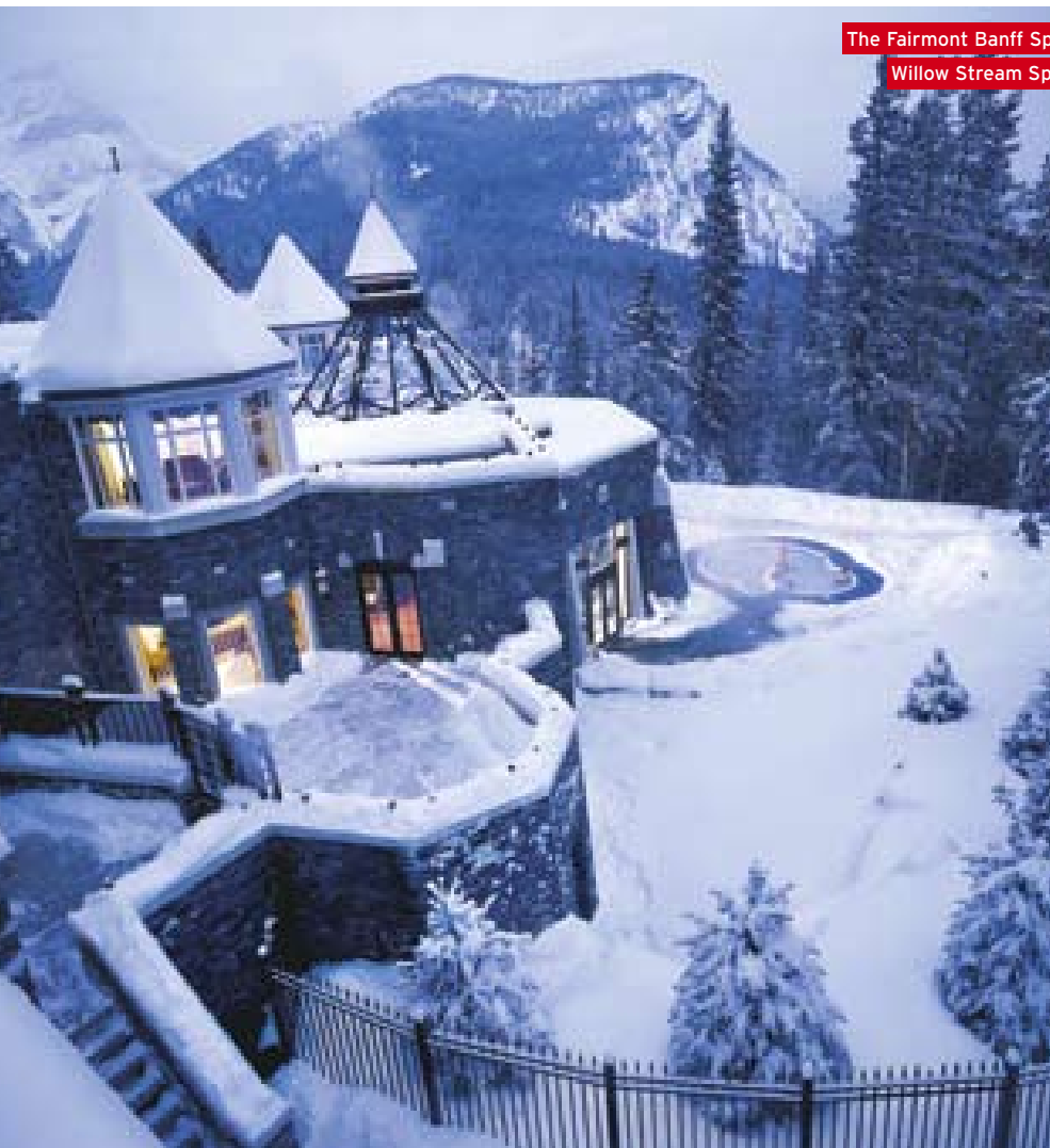
The Fairmont Banff Spring's Willow Stream Spa

(from $190; 355 McGill; +1 866 380 2202; hotelstpaul.com ) and the elegant St James Hotel (from $380; 355 St-Jacques St; +1 514 841 3111; hotellestjames.com ) are excellent places to warm up and settle in. Top wine bars for unwinding are Les Cavistes and Bouchonné Comptoir à Vin. For dining, it's the romantic Club Chasse Et Pêche or the more lively Chez L'Epicier in the heart of the old city. Just outside Montreal are the Laurentian Mountains. Mont Saint Saveur is home to Canada's only Alpine coasting experience, where sliders ride on toboggans for over a kilometre along steel rails at speeds of more than 30 kilometres per hour. Nearby Mont Tremblant is one of eastern North America's biggest ski resorts. Based around a colourful pedestrian village and Lake Tremblant, it features great skiing, snowboarding, sleigh rides and skating. Both slopeside and by the lakeshore, the Quintessence Resort (from $335; 3004 Chemin de la Chapelle; +1 866 425 3400; hotelquintessence.com ) offers 30 high-end suites, each with woodburning fireplaces.