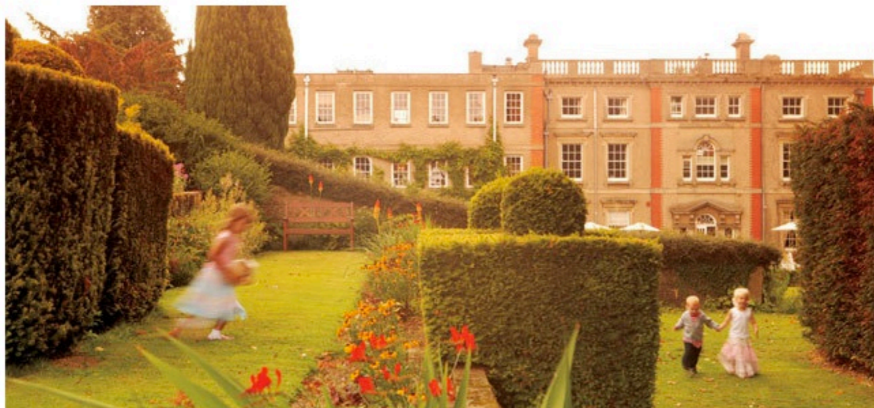
The Elms hotel, Abberley, England; courtesy of von Essen hotels