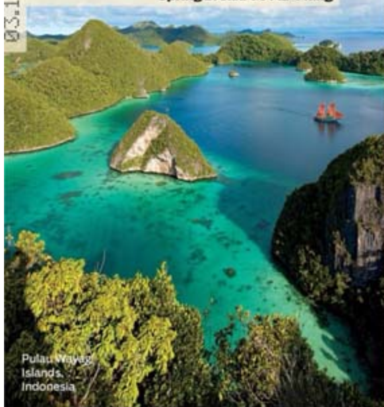
Pulau Wayag Islands, Indonesia