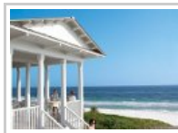
America's Best Waterfront Seafood Shacks