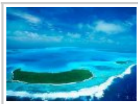
World's Sexiest Affordable Destinations